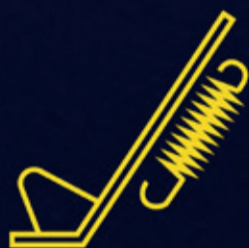
SIDE STAND INDICATION AND ENGINE CUT-OFF