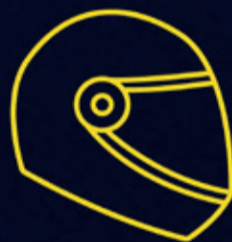
HELMET ATTENTION INDICATION