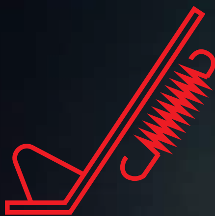
SIDE STAND INDICATION AND ENGINE CUTOFF