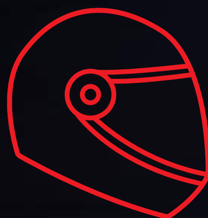
HELMET ATTENTION INDICATION