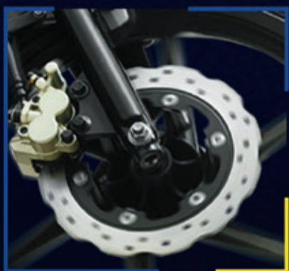
ROTOPETAL DISC BRAKE