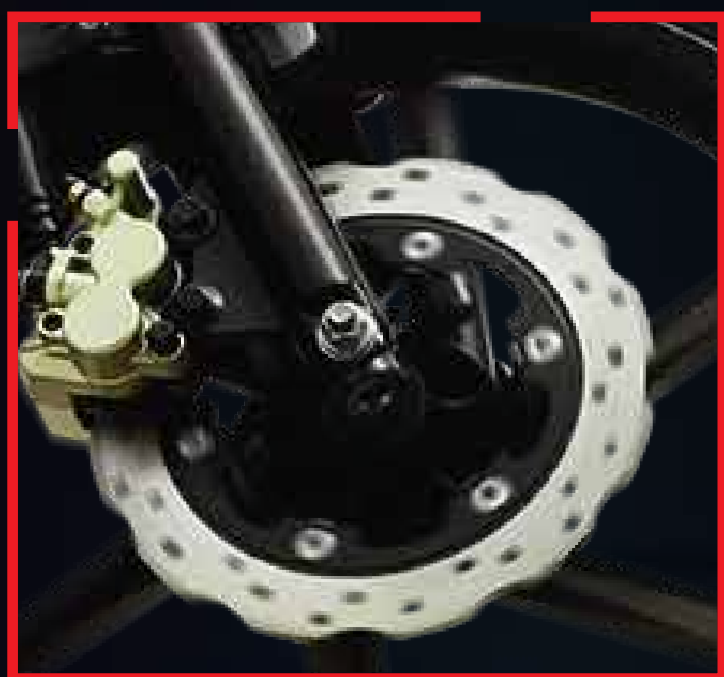
ROTOPETAL DISC BRAKE